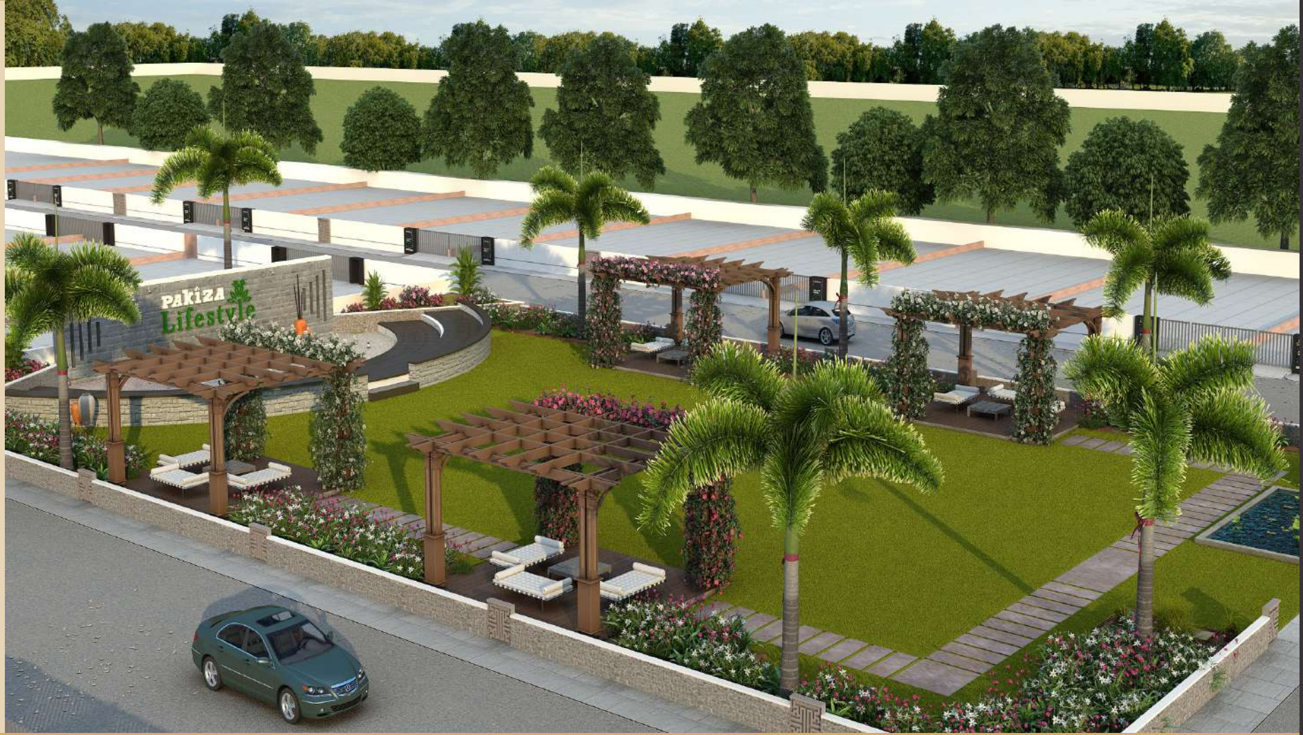
AMPHITHEATER | GAZEBOS | WALKWAY | SEMI BASKETBALL COURT

We know you believe in luxury living and comfortable lifestyle and so, we've planned the best of amenities that'll keep you happy and content.