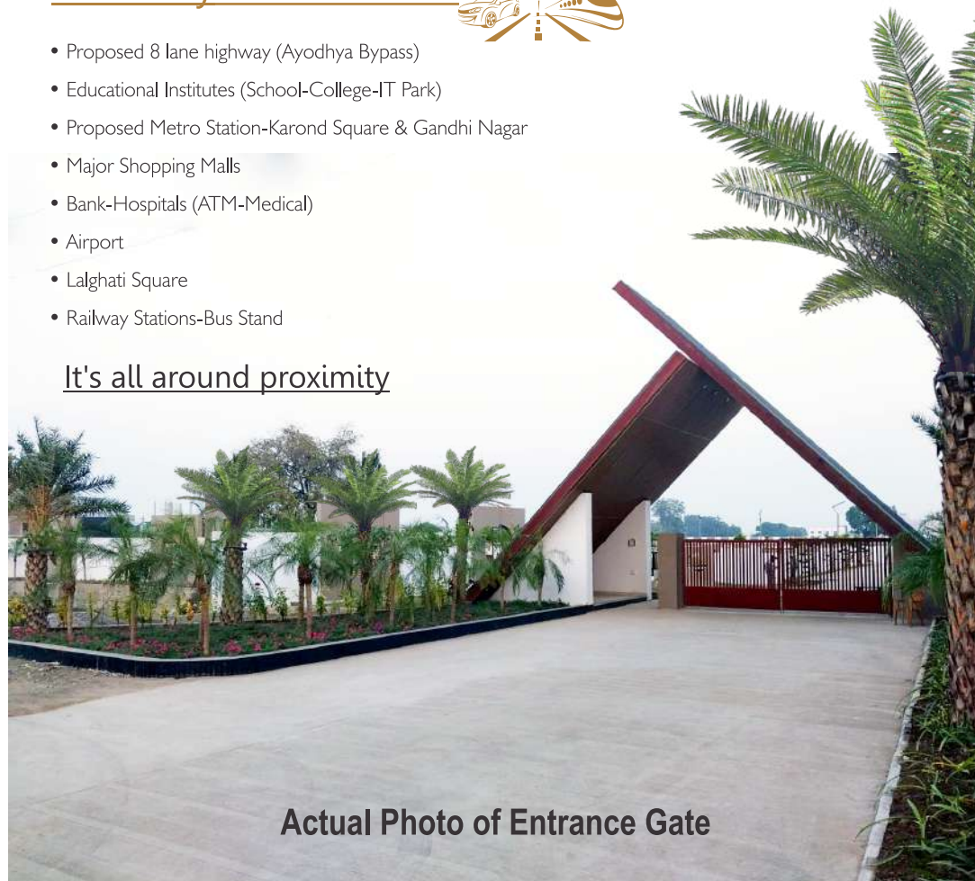
Actual Photo of Entrance Gate